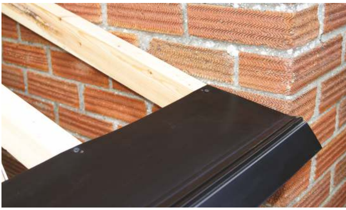
1. Install Easy Tray eaves protection system (EPS).