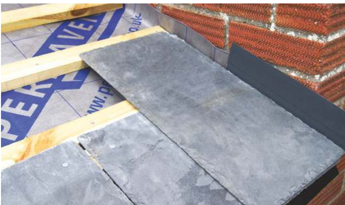
7. Install the first eaves course of slate and place the first Soaker Single in place. Then continue to install the first full slate in the usual way.