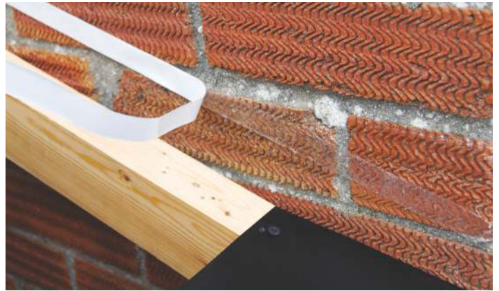
4. Remove Permatac's protective cover and make sure that the membrane is now fully adhered to the abutment wall.