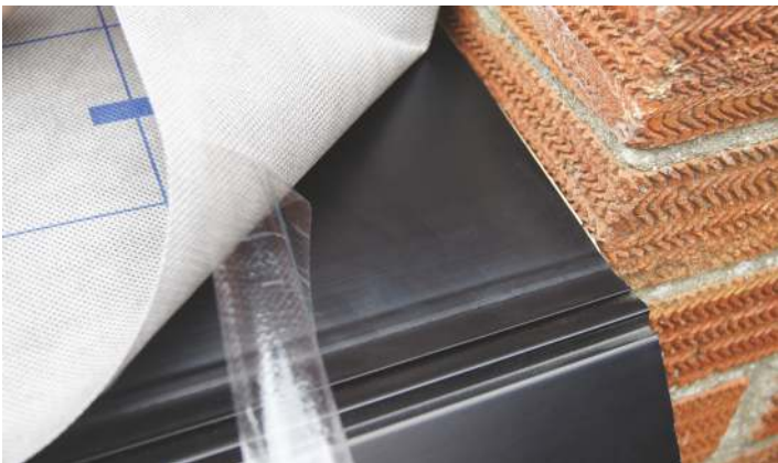
5. Permavent membrane should be stuck to the Easy Tray using the 2XT membranes or Permatac double-sided tape.