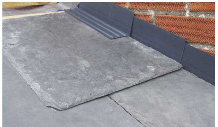
8. Continue up the roof in the usual way using one Soaker Single for every new course.