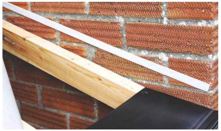
2. Install a line of Permatac double sided tape to the abutment wall approx. 50mm above the rafter line.